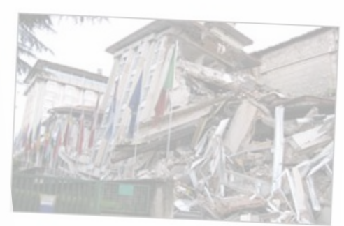
arthquake damage to the Hotel Degli

EFSA has received additional analytical data (see current analytical results) on the